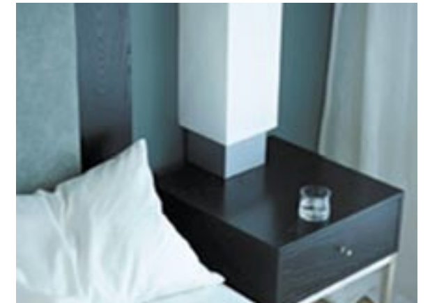
BEDSIDE TABLE TOP IN CORIAN® NOCTURNE.

A bedside table, a desk and a luggage rack here reveal its clean, refined lines, while a stylish shelf unit there blends effortlessly into a tight corner.