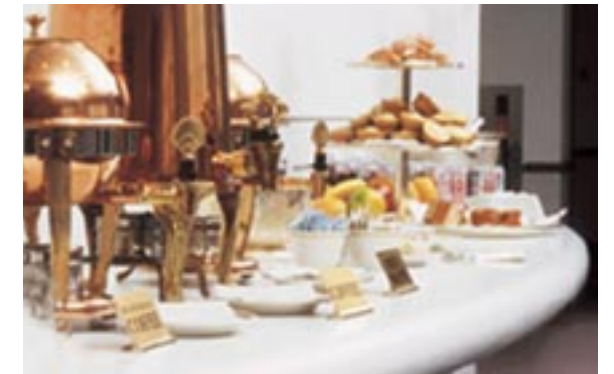
BUFFET IN CORIAN® GLACIER WHITE.

In the background, the subdued lighting of the bar helps guests relax. In a warm, muted atmosphere, the Corian® surface uses colours daringly to reflect the cocktails prepared by the barman. Through informal chats, confidences or the final details of a negotiation, the world is shaped and reshaped along this bar or around the occasional tables in Corian®. And nothing not a spilt drink or a forgotten cigarette will mar its beauty and elegance.