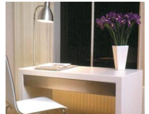
"TABLESTORE", LONDON, UNITED KINGDOM. DESIGN ADRIAN WRIGHT. BRILLIANT SLAB COLLECTION IN CORIAN® GLACIER WHITE.