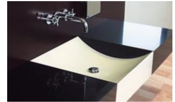
"ZEN" VANITY, MILANO, ITALY. DESIGN MASSIMO FUCCI. VANITY IN CORIAN® NOCTURNE AND CORIAN® BONE.

Corian® also combines beautifully with wood, stainless steel or glass to create original units. Whether you opt for a revitalising shower or a relaxing bath, Corian® ensures an unforgettable experience.