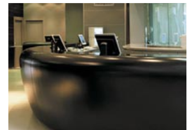
ENTRANCE OF THE LAGUNA PALACE HOTEL, MESTRE, ITALY. DESIGN STUDIO MARCO PIVA.