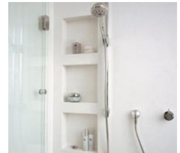
CORIAN® SHOWER WALLS WITH FITTED SHELVES. DESIGN CHARLES ZÄCH.