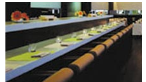
SIDE HOTEL, HAMBURG, GERMANY. DESIGN MATTEO THUN AND BOB WILSON. DETAIL OF SUSHI BAR COUNTER IN CORIAN® SEAGRASS.