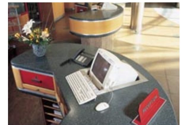
MÖVENPICK HOTEL, OBERURSEL, GERMANY. THREE ROUND RECEPTION DESKS IN CORIAN® RAIN FOREST COMBINED WITH WOOD.