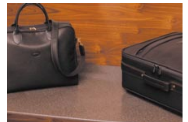
LUGGAGE RACK IN CORIAN® CANYON.