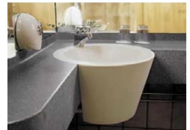
RADISSON SAS ROYAL VIKING HOTEL, STOCKHOLM, SWEDEN. DESIGN SNICKARBOLAGET. VANITY TOP AND BOWL IN CORIAN® CAMEO WHITE AND CORIAN® GRAY FIELDSTONE.

LEFT VANITY TOP AND BOWL IN CORIAN® GLACIER WHITE AND CORIAN® GRAVEL. DESIGN RENAUD HEYMANS.