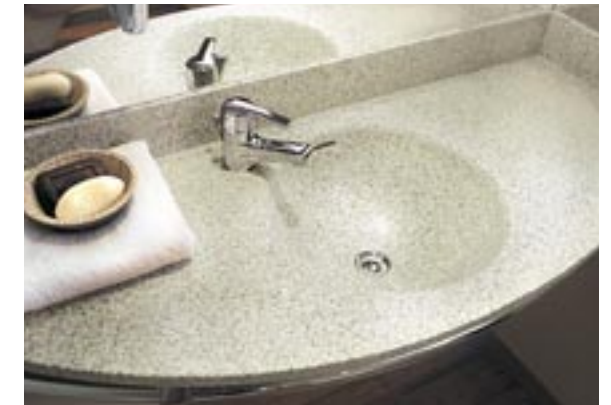
NOVOTEL, ROTTERDAM, THE NETHERLANDS. AN "ALL IN ONE" VANITY BOWL IN CORIAN® PYRENEES.

On a functional level, Corian® offers impeccable standards of hygiene. Solid and non-porous, it is joined without visible seams, creating vanity tops that appear to have been made from a single piece of Corian® and are therefore simple to clean.